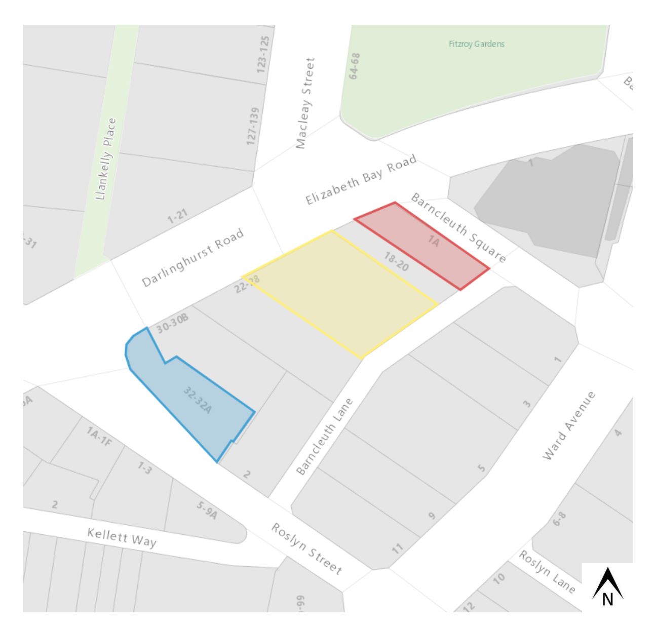
Figure 1: Map of subject sites - 1A Elizabeth Bay Road (Kingsley Hall) in red, 22-24 Darlinghurst Road (The Bourbon) in yellow and 32-32A Darlinghurst Road (The Empire) in blue.