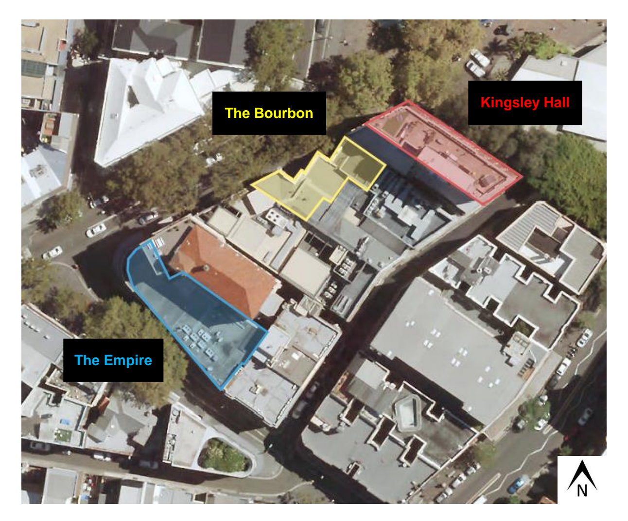
Figure 2: Aerial image of subject sites - extent of proposed heritage listings