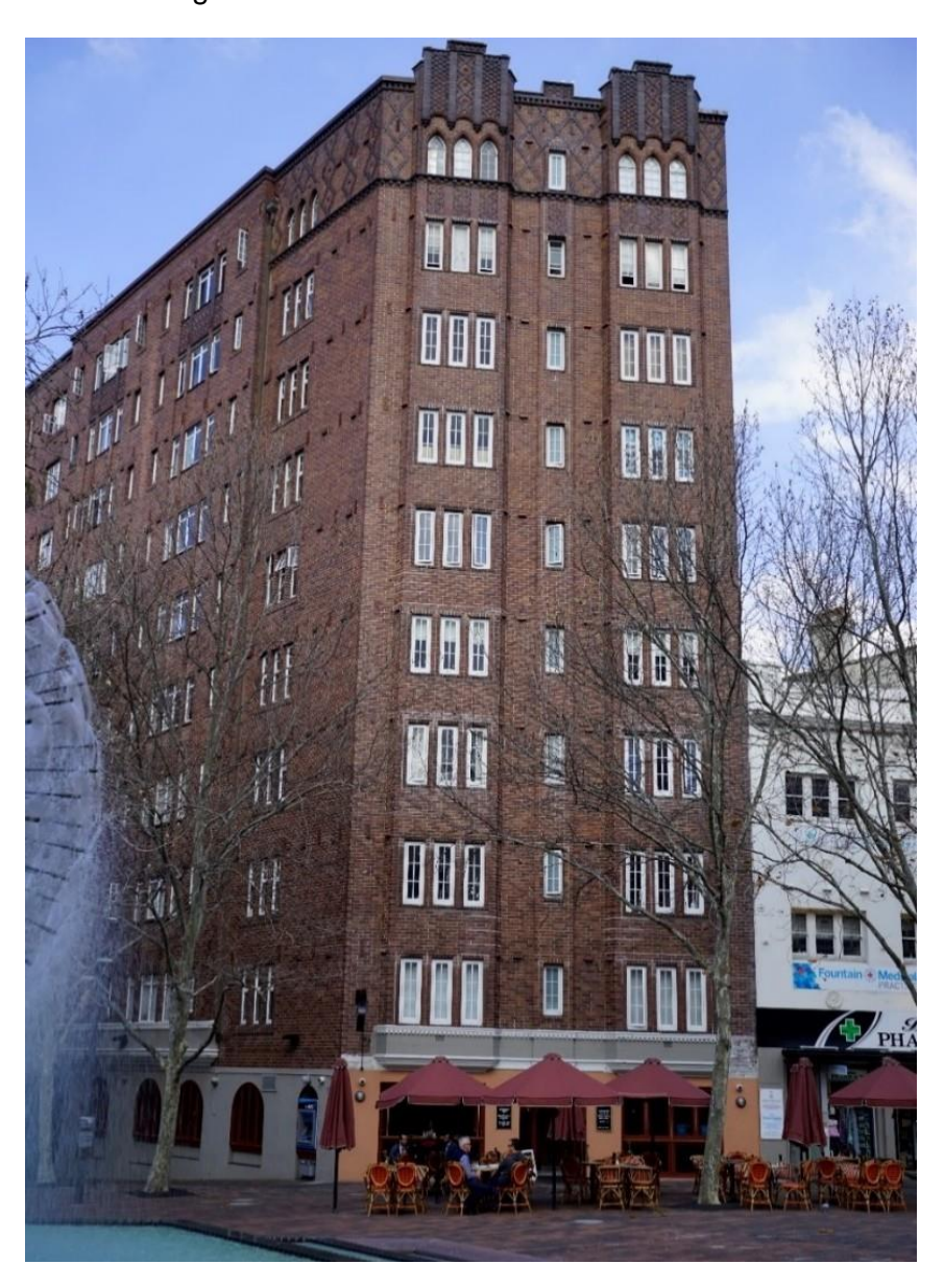
Figure 3: Kingsley Hall at 1A Elizabeth Bay Road, Potts Point

11. Darlinghurst Road is a main road, servicing vehicular and pedestrian traffic. The precinct is characterised by mostly small scale, fine grain commercial buildings of around 3 to 4 storeys interspersed with some larger sites and taller buildings. These include The Bourbon, The Empire, Wintergarden, Kings Cross Library and the development known as 'Omnia', located at the intersection of Darlinghurst Road, Bayswater Road and Victoria Street. Surrounding development is mixed in scale and form, varying from two storey Victorian terraces to multi-storey residential flat buildings.