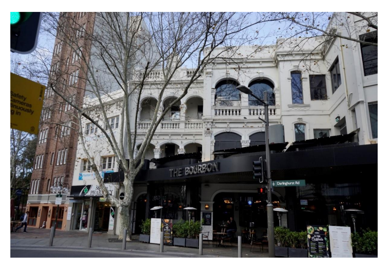
Figure 4: The facade of The Bourbon at 22-24 Darlinghurst Road, Potts Point